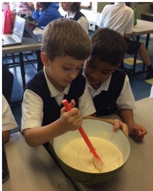
SK students mixing batter for their UOI