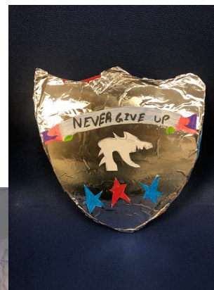
Fourth grade students actively learning about the Middle Ages